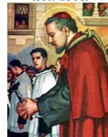
November 4 Patron of Seminarians and Catechists

Oh God, Maintain in your people that spirit with which you inspired your Bishop St. Charles, so that your church may be constantly renewed, conforming itself to Christ and manifesting Christ to the world.